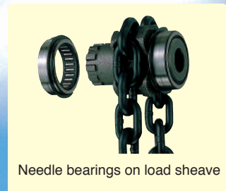
Needle bearings on load sheave